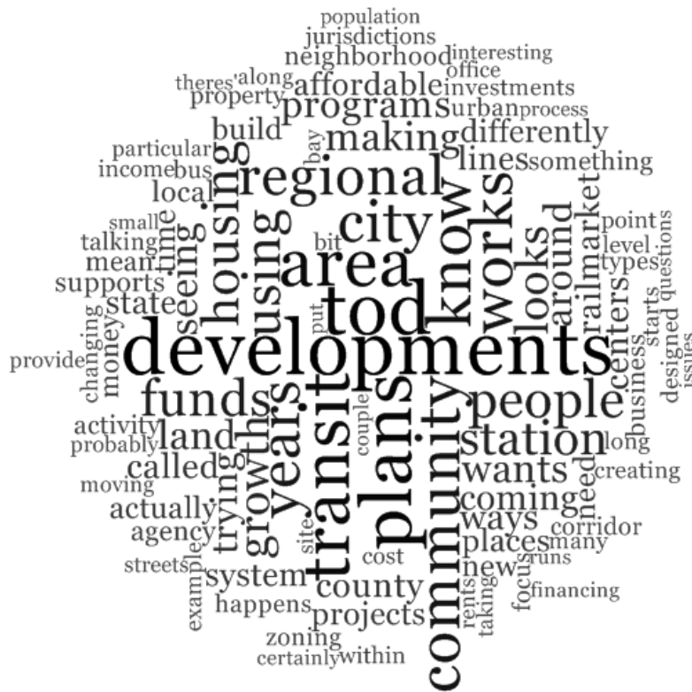
Figure 5-1: Most Commonly Spoken Words in Interviews

“Housing” and “affordable” are both prominent—“income” and “rents” both appear in the cloud as well—underscoring the commonly understood importance of promoting both affordability and TOD. Two of our participants are actually from organizations formed to promote and provide affordable housing that approach TOD as a means to that end; others see TOD as both a cause and a potential adaptation to significant housing affordability issues in a number of major metropolitan areas.